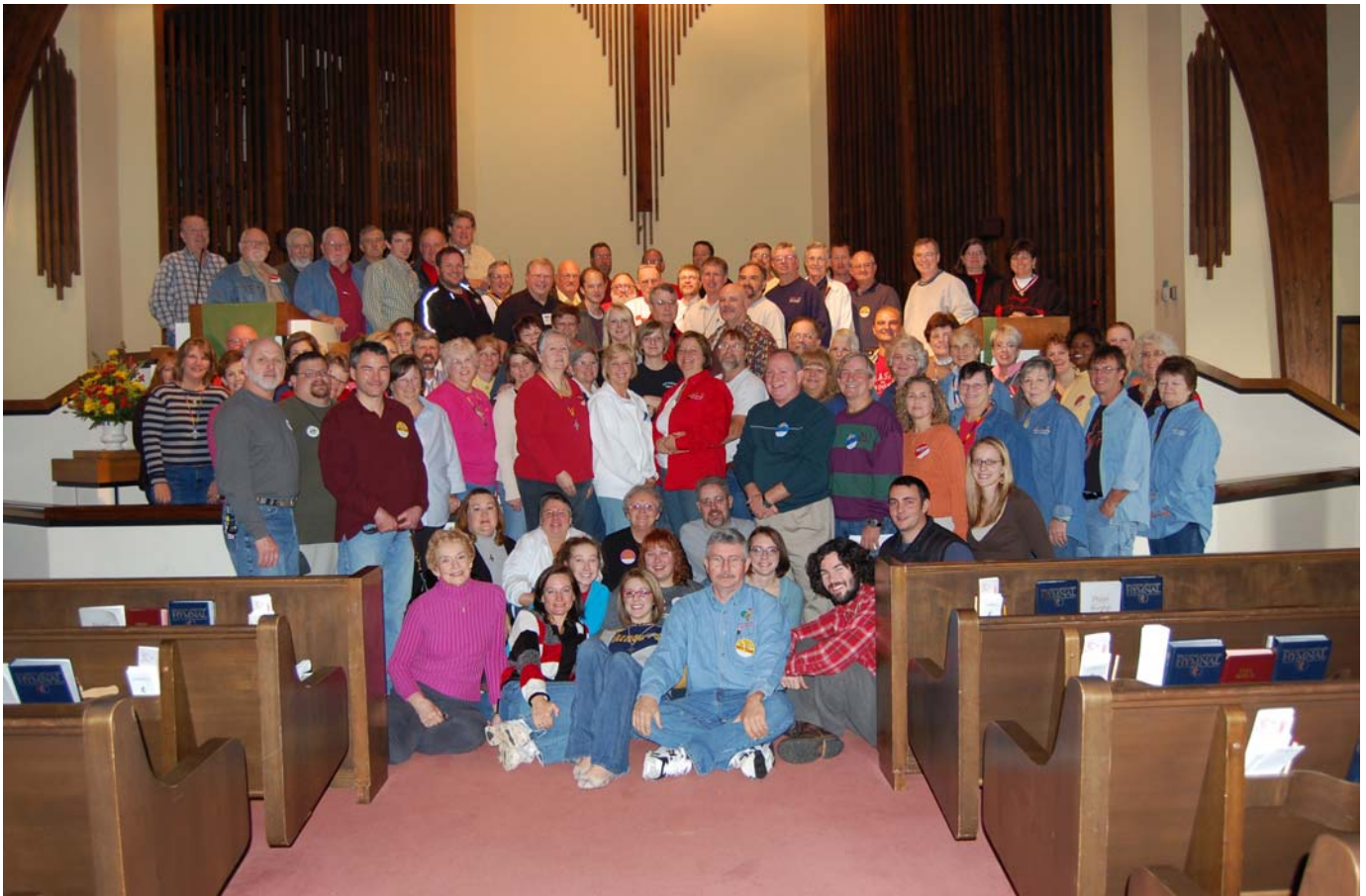
PICTURE TAKEN ON SATURDAY, OCTOBER 25 OF BOTH THE MEN'S AND WOMEN'S TEAM.